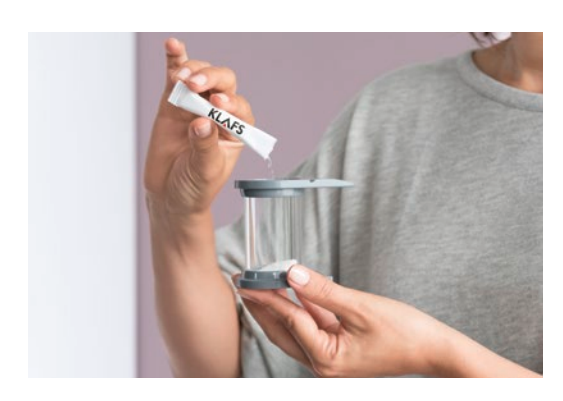
Exact: The salt sticks contain the optimal quantity of salt for one application.

This procedure is extremely easy, because the holding bracket automatically guides the salt cup into the right position.